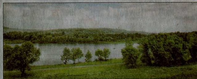
The Town of Chenango is beginning eminent domain proceedings to seize property along the Chenango River.

action will be held Aug. 13 in Cortland County Court. A year ago, Fenton began eminent domain proceedings against the company that owned the riverbank property which is only six-tenths of an acre. Instead of letting the property be condemned, the owner deeded the property to Fenton, court records show. "Fenton acquired the property for the express purpose of excluding