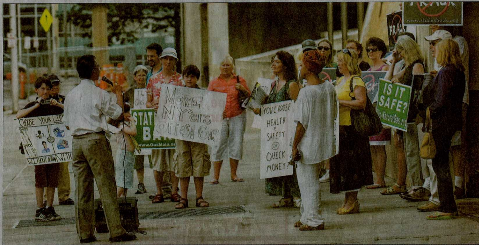
Anti-drilling protesters gather Wednesday at Binghamton's State Office Building as gubernatorial candidate Andrew Cuomo was in town.